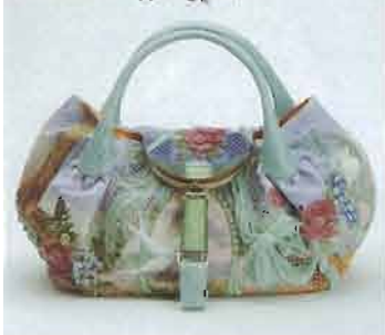
Embroidered spy bag $12,700